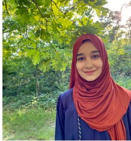
Ujala Dar Biology and Globalization Studies and International Relations