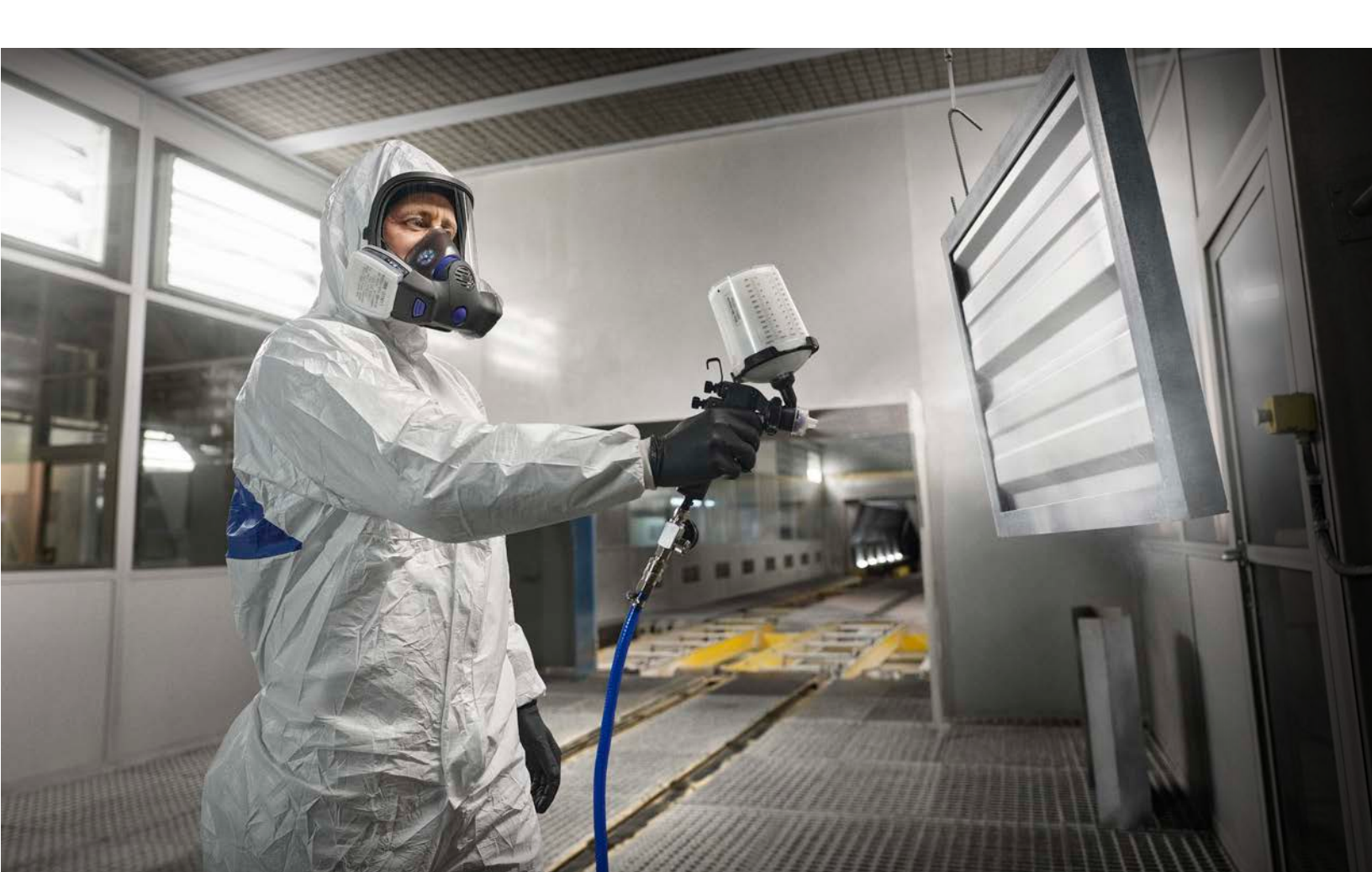
Utilize the speaking diaphragm to help provide easy communication.