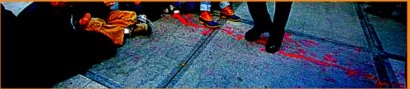
Photo: A University of California, Davis police officer pepper-sprays students during their sit-in at an "Occupy UCD" demonstration in Davis, California, on Nov. 18, 2011.

THE HUMANITIES INSTITUTE AT STONY BROOK PRESENTS