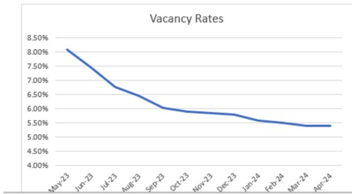
SBUH Employees – May 2023 – April 2024